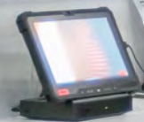
ABB Service Your partner of choice across the entire asset life cycle