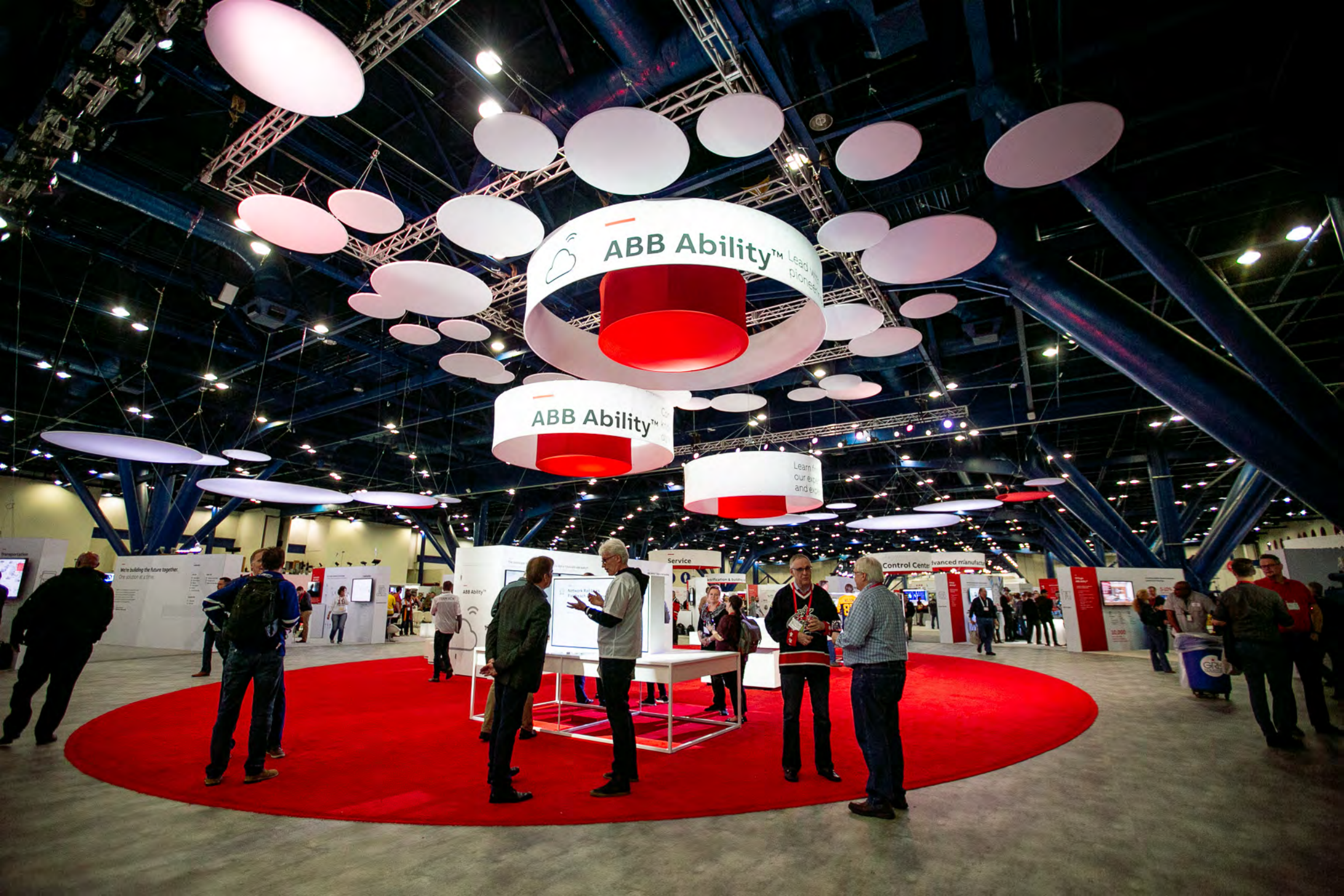
ABB Ability™ Lead the way in pioneering