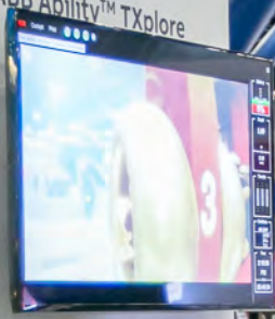
ABB Ability™ TXolore