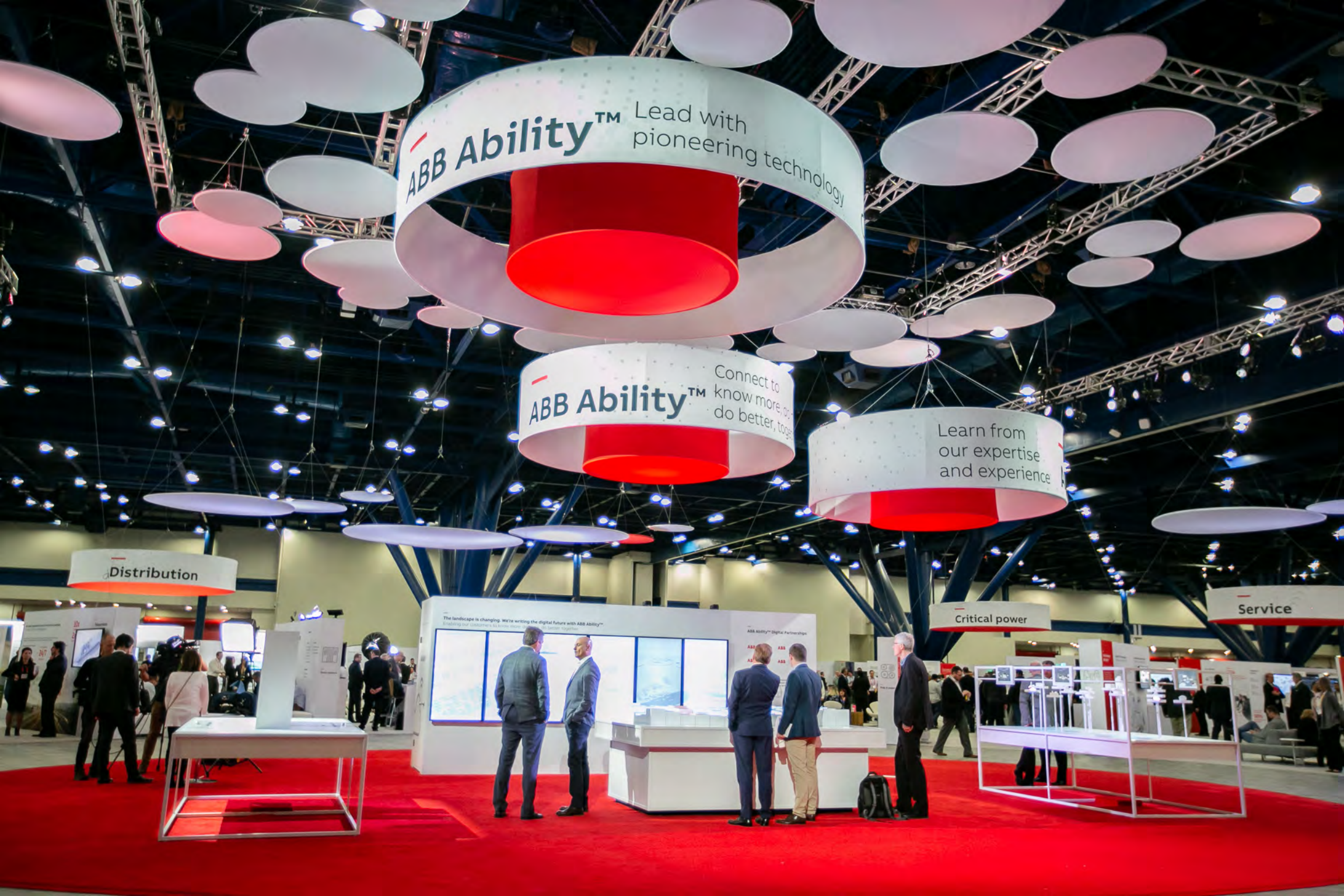
ABB Ability™ Digital Partnerships

The landscape is changing. We're writing the digital future with ABB Ability™. Enabling our customers to better manage their energy systems together.