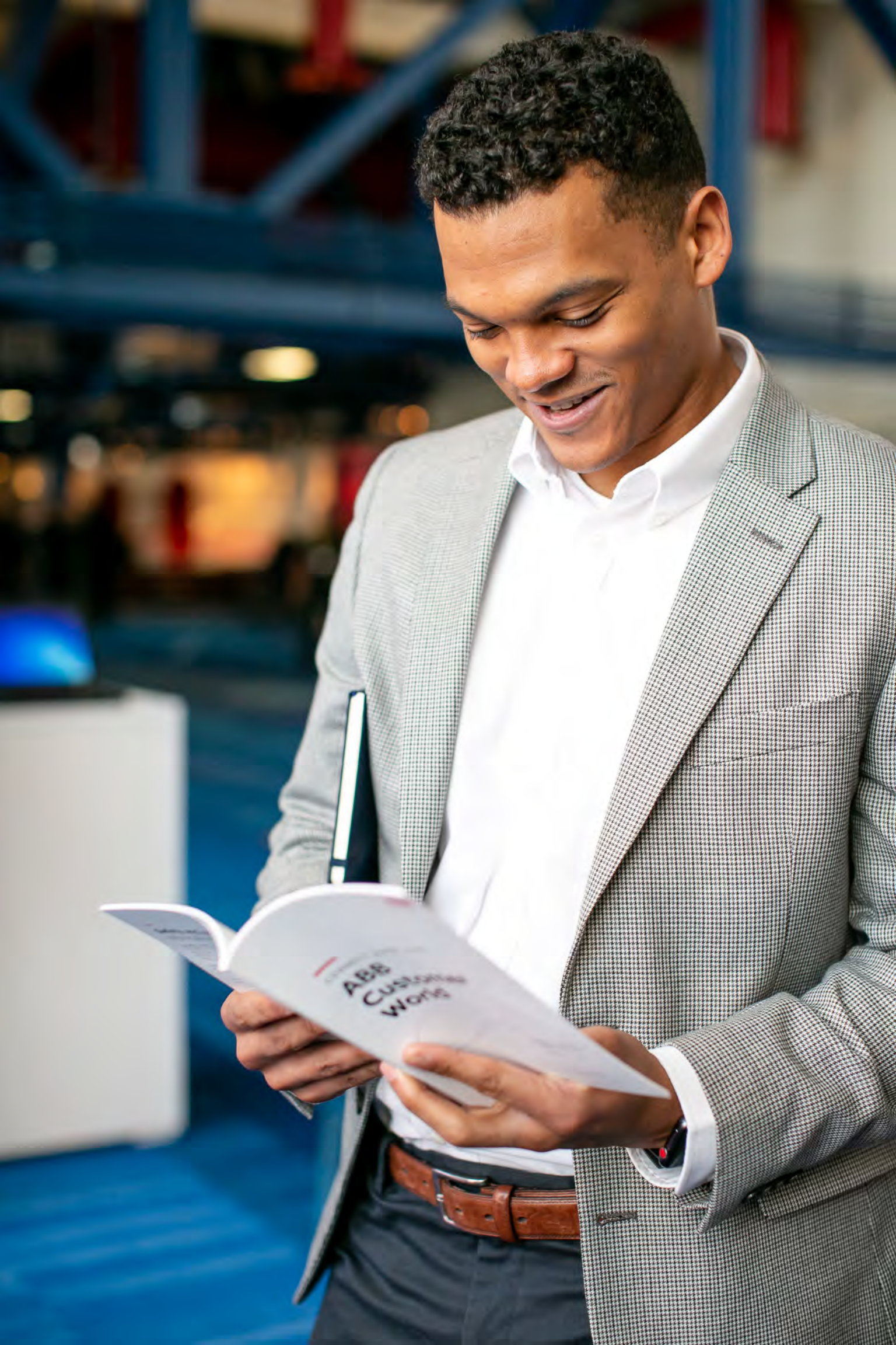
ABB Customer Works