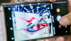
ABB FORMULA 1